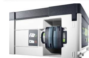
Image: Festool-CTC-SYS-03.jpg Impressive suction power: Comparable power to the mains-operated extractors thanks to the 36-volt turbine with two 18-volt battery packs.

Image: Festool-CTC-SYS-02.jpg CTC SYS cordless Systainer extractor: For carrying: The cordless extractor in the Systainer format.