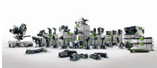
Image: Festool-CTC-SYS-00.jpg Festool's 18-volt range continues to expand, and now includes new cordless extractors for a healthy and dust-free working environment.