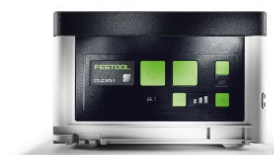
Image: Festool-CTC-SYS-02.jpg CTC SYS cordless Systainer extractor: For carrying: The cordless extractor in the Systainer format.

Image: Festool-CTC-SYS-01.jpg CTC SYS cordless Systainer extractor: For carrying: The cordless extractor in the Systainer format.