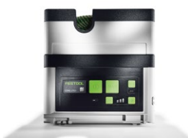
Image: Festool-CTC-SYS-01.jpg CTC SYS cordless Systainer extractor: For carrying: The cordless extractor in the Systainer format.

Image: Festool-CTC-SYS-00.jpg Festool's 18-volt range continues to expand, and now includes new cordless extractors for a healthy and dust-free working environment.