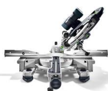
Image: Festool-KSC60-03.jpg Thanks to its mitre angles of up to 60 degrees on both sides and the bevel angle of up to 46 degrees (on the right-hand side) or 47 degrees (on the left-hand side), the new KSC 60 is ultra-flexible in operation.

Image: Festool-KSC60-02.jpg The intelligent dual battery system gives the saw more torque and range.