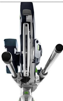
Image: Festool-KSC60-05.jpg The twin-column guide with two bearings ensures the saw blade is guided smoothly and with precision.

Image: Festool-KSC60-04.jpg Using variable speed preselection, the saw can adapt to suit the material.