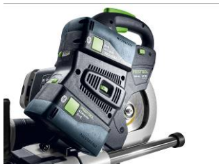
Image: Festool-KSC60-02.jpg The intelligent dual battery system gives the saw more torque and range.