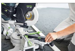
Image: Festool-KSC60-13.jpg A convenient bevel is also included as standard, which makes the rapid measurement of interior and exterior angles and subsequent transfer to the saw simple and precise.

Image: Festool-KSC60-12.jpg Workbench for long workpieces: The height-adjustable feet raise the workbench on the KSC 60 to match the exact height of the SYS 3 M 112 or SYS 1 Systainer.