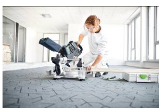
Image: Festool-KSC60-12.jpg Workbench for long workpieces: The height-adjustable feet raise the workbench on the KSC 60 to match the exact height of the SYS 3 M 112 or SYS 1 Systainer.

Image: Festool-KSC60-11.jpg Workbench for long workpieces: The height-adjustable feet raise the workbench on the KSC 60 to match the exact height of the SYS 3 M 112 or SYS 1 Systainer.