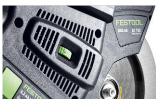
Image: Festool-KSC60-04.jpg Using variable speed preselection, the saw can adapt to suit the material.

Image: Festool-KSC60-03.jpg Thanks to its mitre angles of up to 60 degrees on both sides and the bevel angle of up to 46 degrees (on the right-hand side) or 47 degrees (on the left-hand side), the new KSC 60 is ultra-flexible in operation.