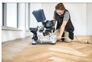
Image: Festool-KSC60-06.jpg The KSC 60 is supplied ex-works with a dust collection bag, making it ideal for portable use and smaller sawing jobs.

Image: Festool-KSC60-05.jpg The twin-column guide with two bearings ensures the saw blade is guided smoothly and with precision.