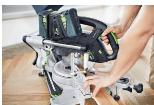
Image: Festool-KSC60-07.jpg With the new KSC 60 cordless sliding compound mitre saw, precision is no accident; it is a matter of certainty – every step of the way.

Image: Festool-KSC60-06.jpg The KSC 60 is supplied ex-works with a dust collection bag, making it ideal for portable use and smaller sawing jobs.