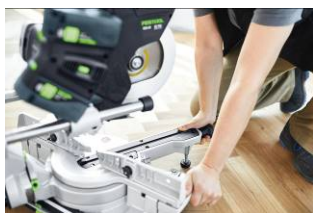
Image: Festool-KSC60-08.jpg The latest generation of brushless EC-TEC motor, combined with the dual battery system, ensures maximum power that lasts the whole day.