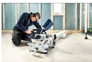
Image: Festool-KSC60-11.jpg Workbench for long workpieces: The height-adjustable feet raise the workbench on the KSC 60 to match the exact height of the SYS 3 M 112 or SYS 1 Systainer.