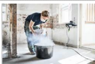
Image: Festool_MX-dust-extraction_02.jpg A lot of dust is always produced when filling and mixing powdered materials. The new MX dust extraction system makes it easy to avoid this situation.