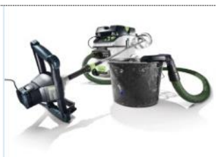
Image: Festool_MX-dust-extraction_00.jpg Dust-free mixing at last – with the new MX stirrer with dust extraction