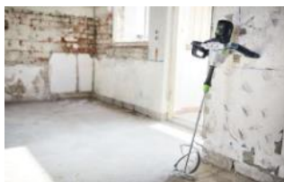
Image: Festool_MX-dust-extraction_10.jpg Stable rubber corners protect the stirrer from damage and also protect the floor in the event of an accidental fall.