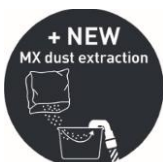
Image: Festool_MX-dust-extraction_01.jpg The new MX stirrers with dust extraction allow users to mix and stir in a healthy way.