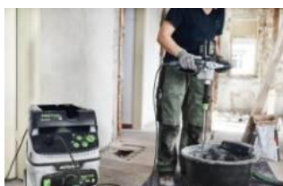
Image: Festool_MX-dust-extraction_11.jpg Little effort required for ergonomically guiding the MX stirrer thanks to the practical handle design with large lever arm. Festool has also equipped its new MX stirrers with a powerful motor with power electronics.

Image: Festool_MX-dust-extraction_10.jpg Stable rubber corners protect the stirrer from damage and also protect the floor in the event of an accidental fall.