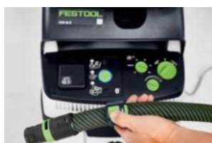
Image: Festool-system-extension-04.jpg The remote control saves you a trip to the extractor.

Image: Festool-system-extension-03.jpg The retrofitable CT-F I/M-Set Bluetooth® module/remote control