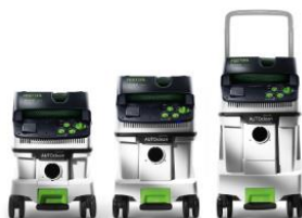
Image: Festool-system-extension-01.jpg More than just dust extraction: Optimum workflows with system expansions from Festool.