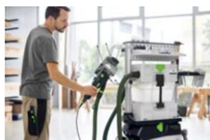
Image: Festool-system-extension-02.jpg Ideal workstation for routing wooden joints: Extractor with remote control, Workcenter and pre-separator, DOMINO joining machine and routing accessories.

Image: Festool-system-extension-01.jpg More than just dust extraction: Optimum workflows with system expansions from Festool.