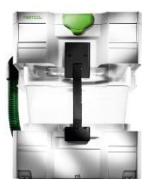
Image: Festool-system-extension-07.jpg With the CT-VA pre-separator, large quantities of dust can be handled efficiently, easily and reliably.

Image: Festool-system-extension-06.jpg This wireless control function provides unrivalled flexibility and convenience and can be easily retrofitted to older extractors.