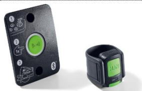
Image: Festool-system-extension-03.jpg The retrofitable CT-F I/M-Set Bluetooth® module/remote control

Image: Festool-system-extension-02.jpg Ideal workstation for routing wooden joints: Extractor with remote control, Workcenter and pre-separator, DOMINO joining machine and routing accessories.