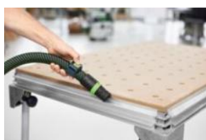
Image: Festool-system-extension-05.jpg This wireless control function provides unrivalled flexibility and convenience and can be easily retrofitted to older extractors.

Image: Festool-system-extension-04.jpg The remote control saves you a trip to the extractor.