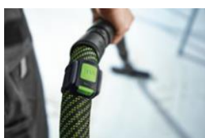
Image: Festool-system-extension-06.jpg This wireless control function provides unrivalled flexibility and convenience and can be easily retrofitted to older extractors.

Image: Festool-system-extension-05.jpg This wireless control function provides unrivalled flexibility and convenience and can be easily retrofitted to older extractors.